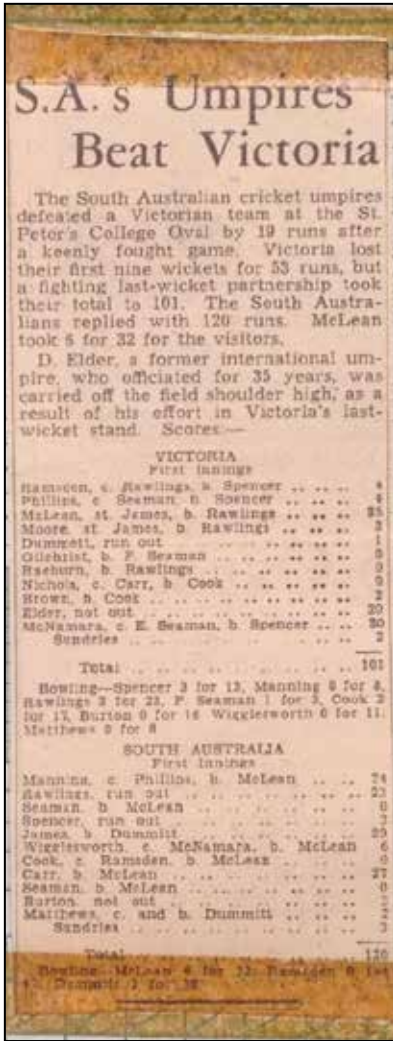
1936 match report from The Mail 11 April 1936