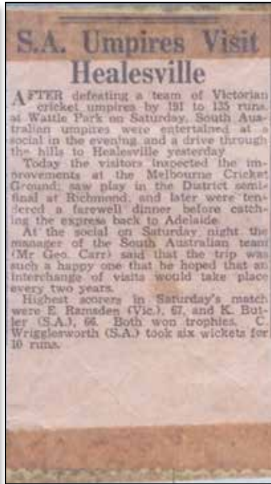
Report of post-match visit to Healesville, now believed to be referring to the 1937 match