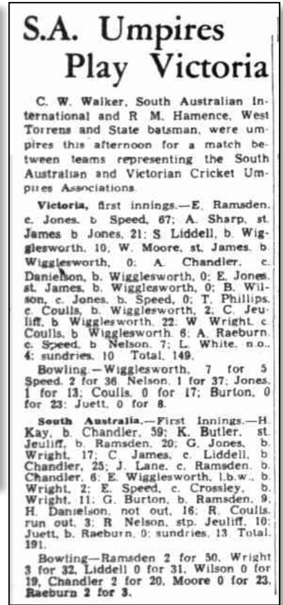
1939 match report from The Mail 8 April 1939

The three newspaper cuttings above are those discussed in the Introduction. The two articles at left were pasted into an old scorebook on pages labelled 49 and 47 but were otherwise unidentified, and hitherto were assumed to refer to those two matches. Recent research has established that the article at left was written in 1936, and that the Healesville article was probably written in 1937. The 1939 article was discovered in the process of researching the other two. Combined, they give us detail we never previously had of these three pre-war matches.